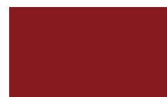
77 1645 Dark Maroon