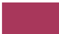
77 1644 Maroon