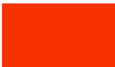
17 1657 Intensive Red