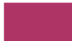
77 1641 Magenta