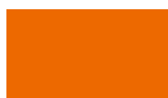
17 1605 Red-Orange