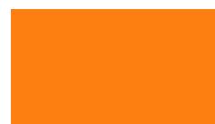
17 1656 Orange