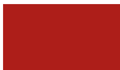
17 1658 Dark Red