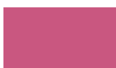
77 1651 Light Purple