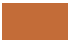
16 1650 Light Brown