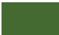
11 1650 Chrome Green