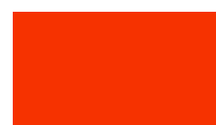
17 1606 Intensive Red