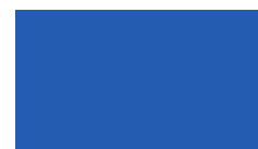
12 1654 Cobalt Blue