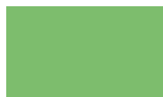
11 1653 Green