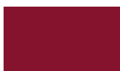
77 1650 Purple